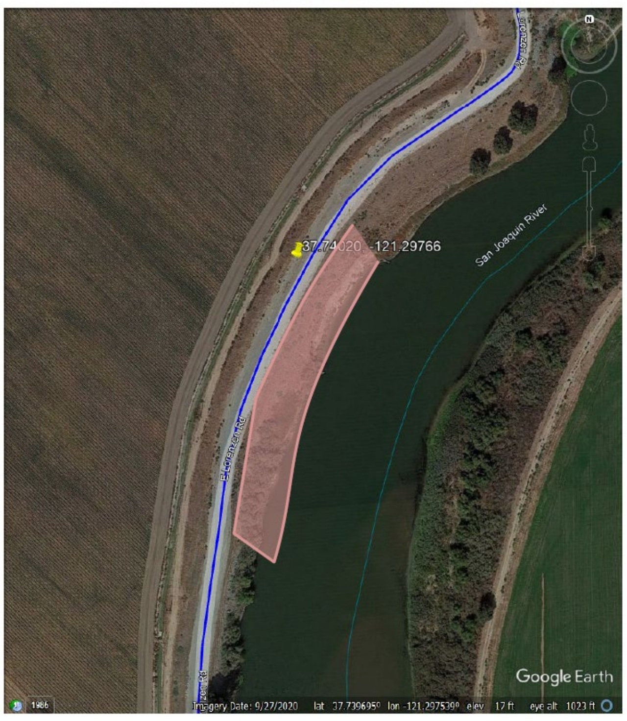
3) Approximate project footprint map